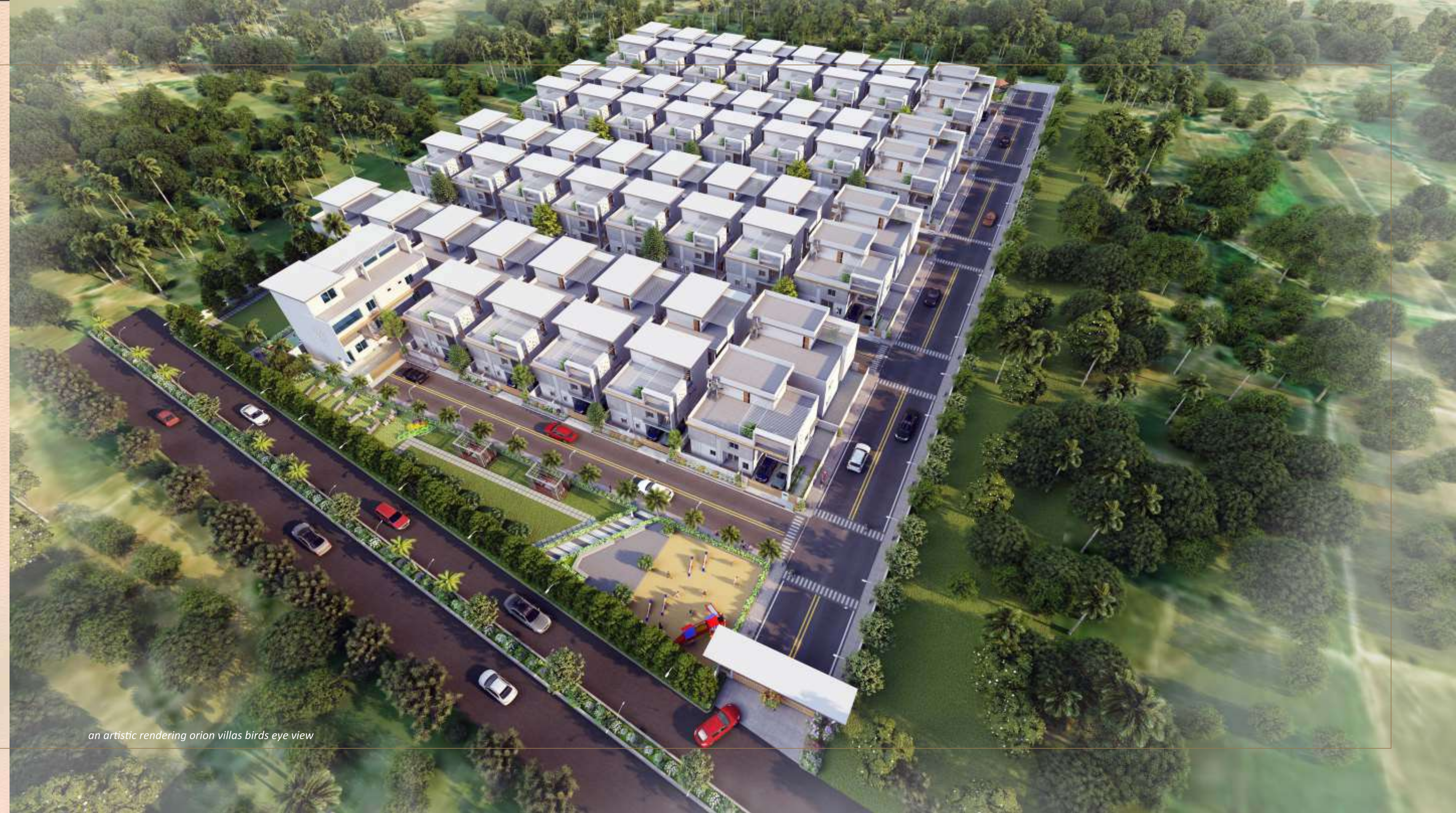
an artistic rendering orion villas birds eye view