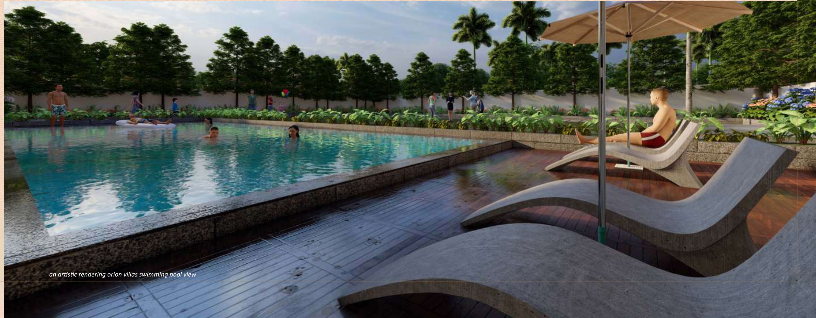
an artistic rendering orion villas swimming pool view