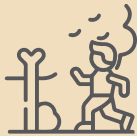
Gym & Jogging Track