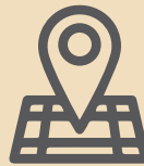
216 Open Plots