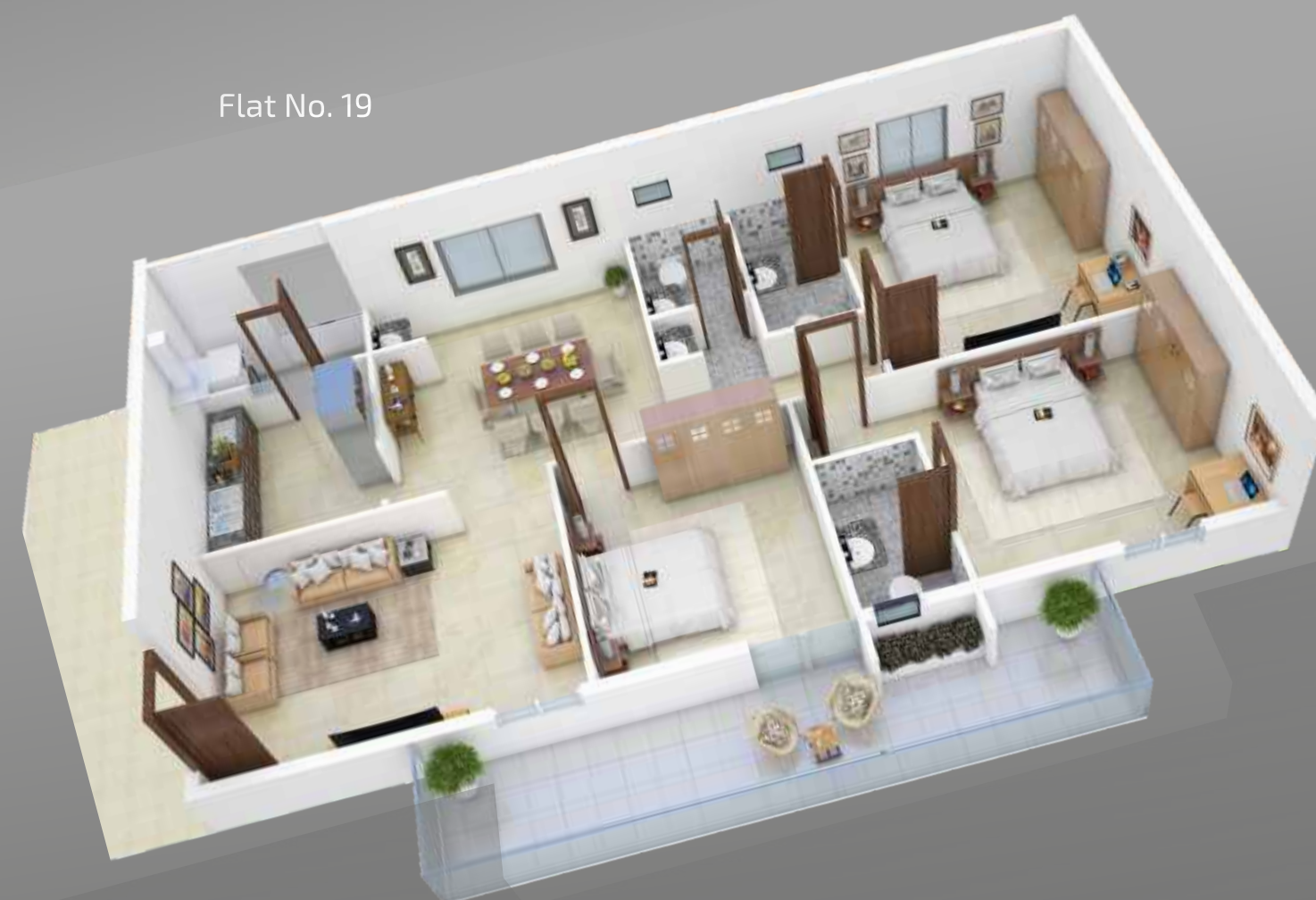
Flat No. 19