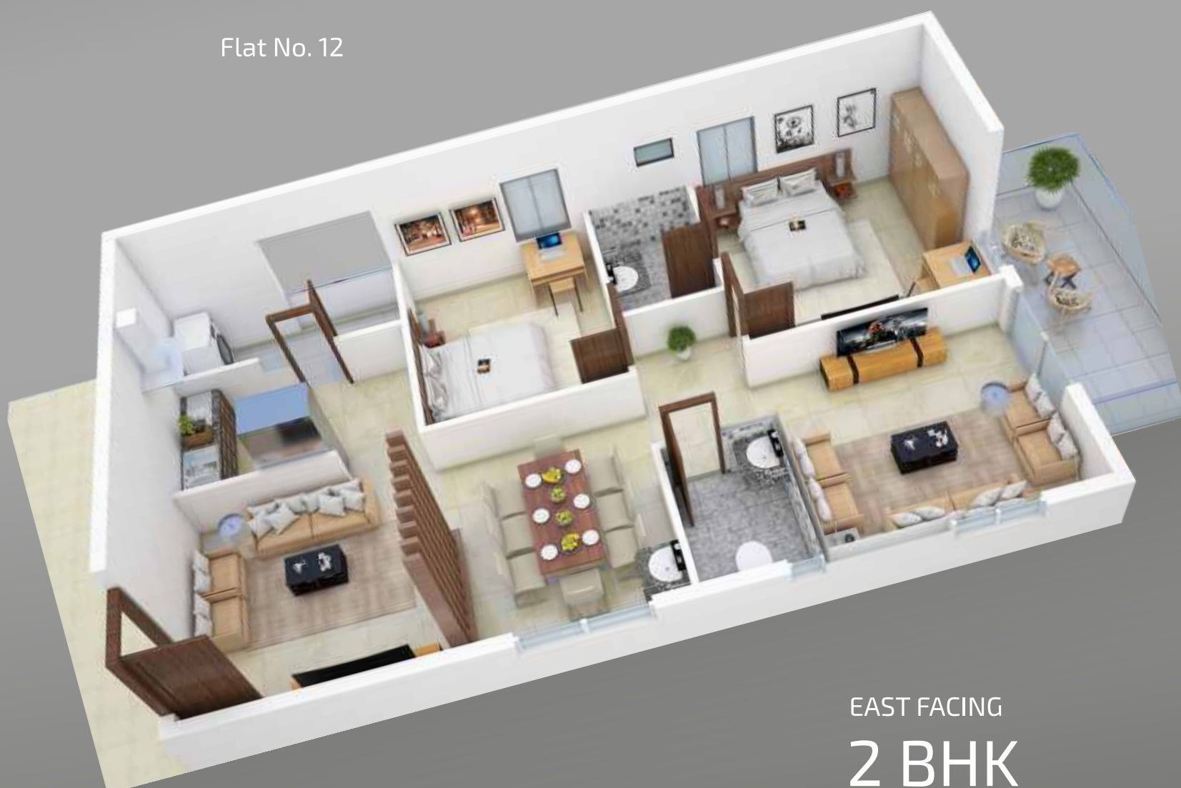
Flat No. 12