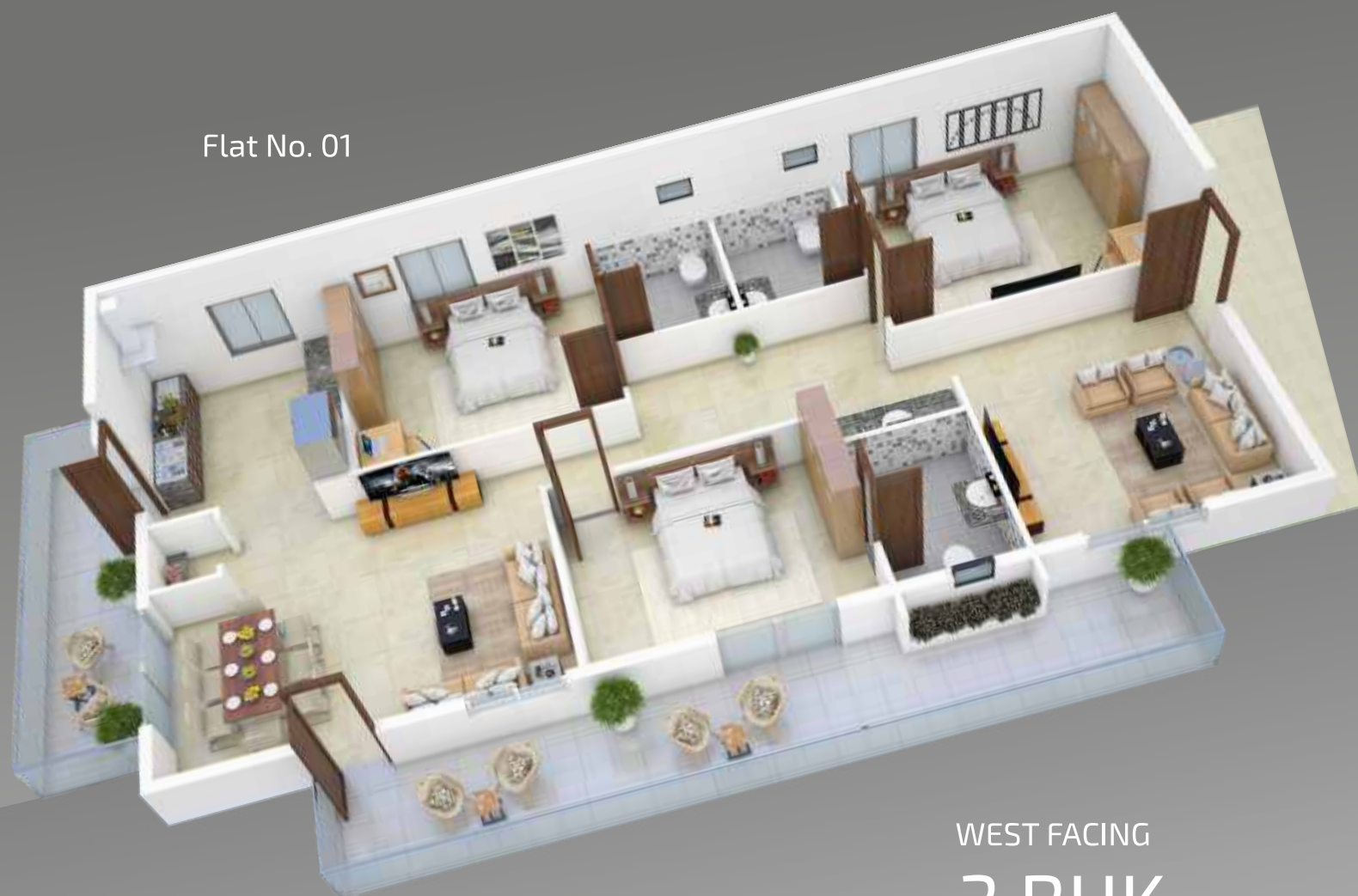
Flat No. 01