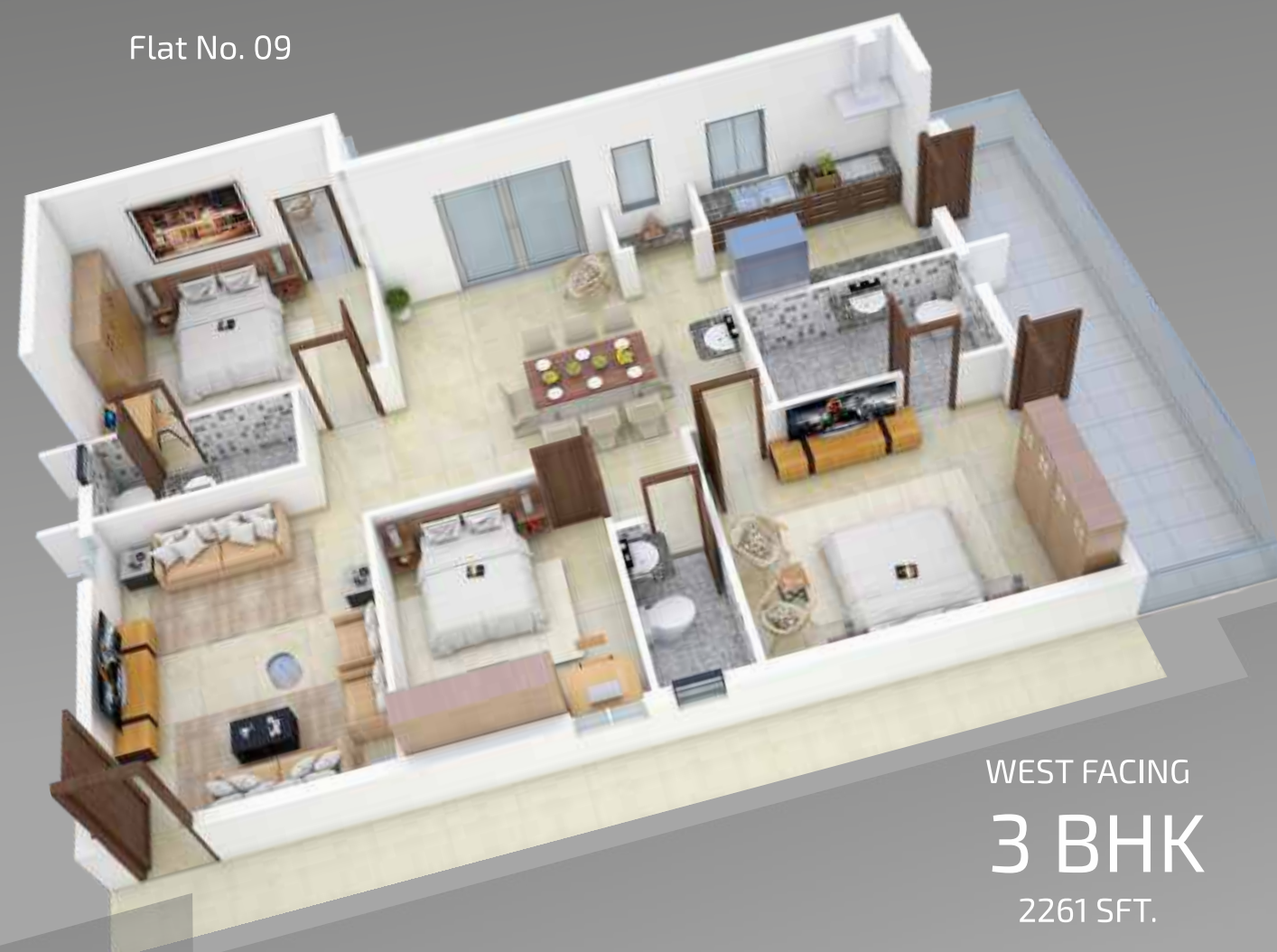
Flat No. 09